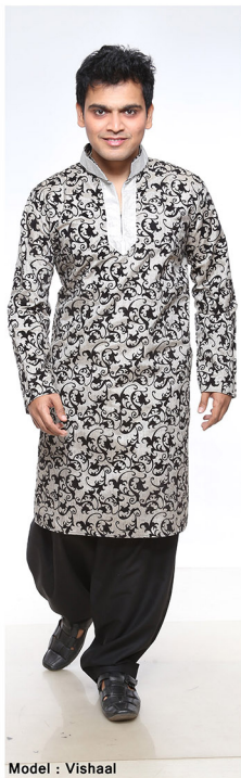
Model : Vishaal

"I aspire to be a fitness model, on the cover of magazines like Shape, and Sports Illustrated. To reach this goal, I have hired a personal trainer, and I work out six days a week. I have my first fitness shoot, to build up my portfolio, booked for next week."